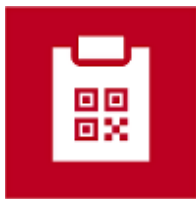
Vaccination Certificate of Covid-19 App App Store (for Iphone)