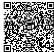
Vaccination Certificate of Covid-19 App Google Play Store (For Android)