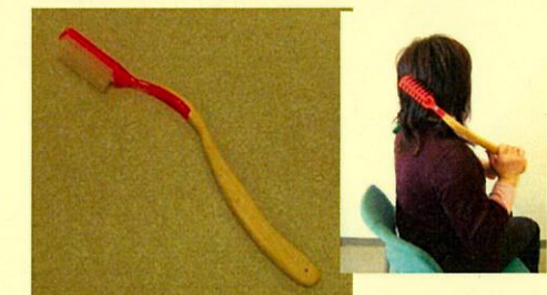
Brush handle extensions