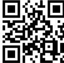
Shizuoka City Association for Multicultural Exchange